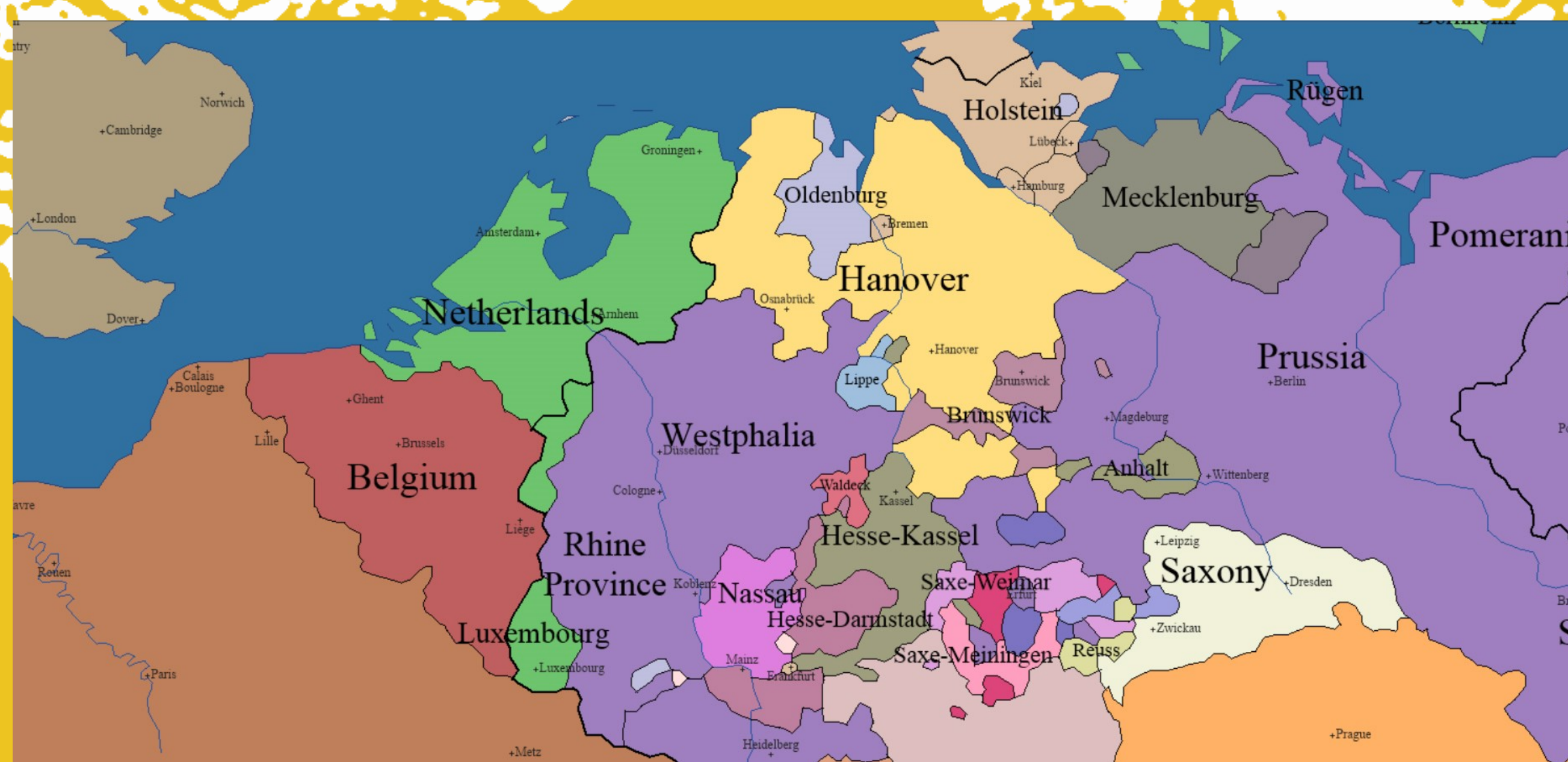
Map of Central Europe, 1849